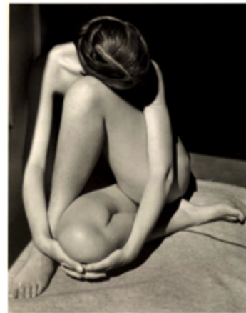
EDWARD WESTON Nude 1936 Lecture 11: American Modernism