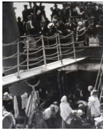
ALFRED STIEGLITZ The Steerage 1907 Lecture 10: Pictorialism II *MAIN TEXT