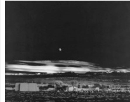
ANSEL ADAMS Moonrise Over Hernandez, NM 1941 Lecture 11: American Modernism