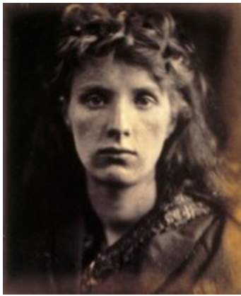
JULIA MARGARET CAMERON The Mountain Nymph, Sweet Liberty 1866 Lecture 9: Pictorialism I *MAIN TEXT